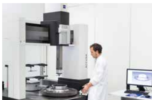
CMM machine Zeiss Accura II 9.12.8