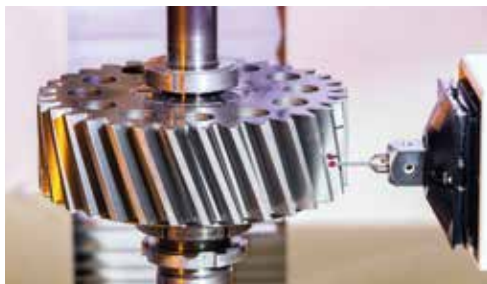
Gear Testing machine Gleason Sigma CNC650